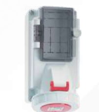
Socket-outlet with MCB Provision